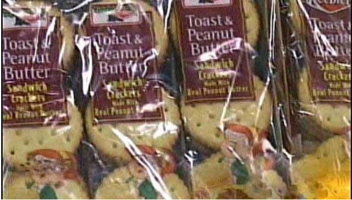
Peanut butter crackers